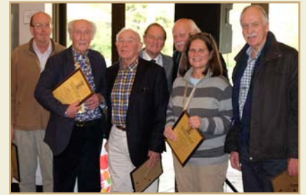
Special Volunteer Awards 2022