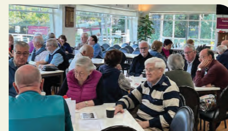
Volunteers at our friendly Forum