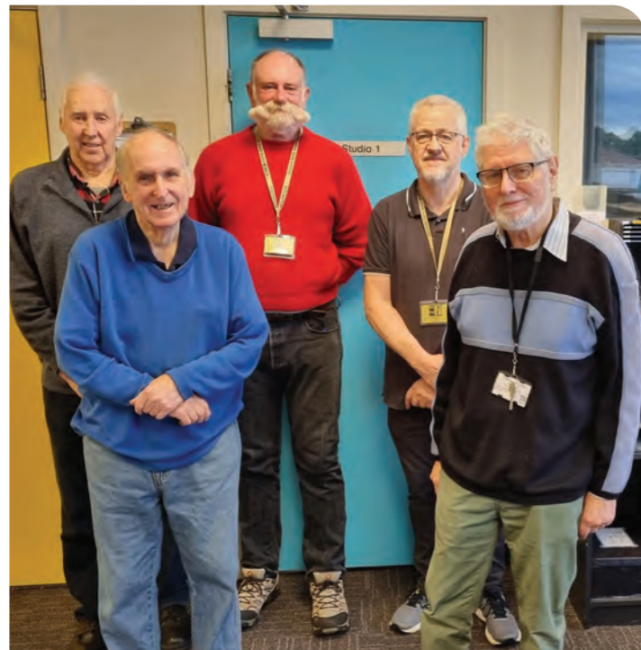
Our friendly team of engineers

Our engineers are the people who keep all the equipment in order to keep us on the air around the clock. They are on call when we have a mishap. All are highly skilled and are at the studio every Tuesday to check the equipment. During their Tuesday stint they have coffee and biscuits and discuss how to fix the world.